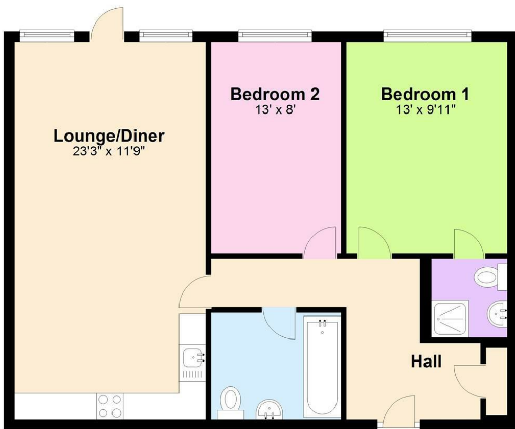
Ground Floor Approx. 700.7 sq. feet